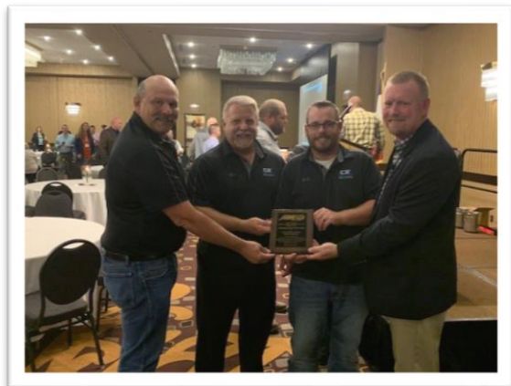
Central Iowa Televising, Contractor of the Year Award