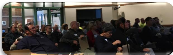
Another full house for Resiliency Focused Lunch and Learn.

The Iowa Chapter of APWA's Sustainability Committee partnered with the City of Coralville and other local agencies to host a resiliency focused lunch and learn for local municipal staff and consultants within the Iowa City regional area. For many cities, the sustainability person is not within public works, therefore partnering with other groups can greatly extend their reach. The lunch and learn occurred on October 28, 2019, and