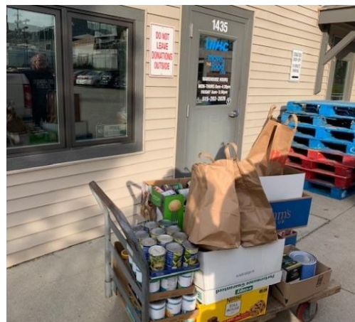
Food Donations from Fall Golf Outing Food-drive.

It is an Iowa Chapter tradition to hold a golf outing in conjunction with the chapter's fall conference. It is also tradition to invite participants to bring non-perishable food items as a donation. This year's response from golfers was great. Any golfers who brought a donation were eligible to receive up to two mulligans during the outing. While we do have a few in the group that may chose not to use these mulligans even when they have them, the vast majority appreciate them! In 2019, the non-perishable and cash donations were taken to a local food pantry in Des Moines.