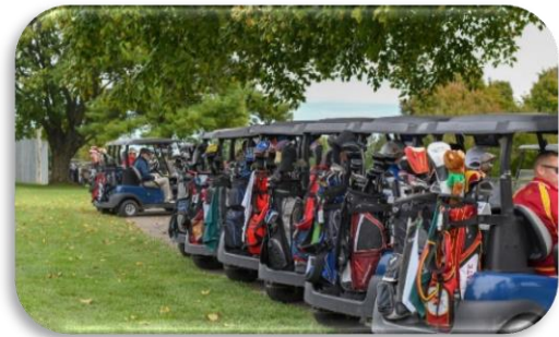
Lining up for the Fall Conference Golf Outing A.H. Blank Golf Course.