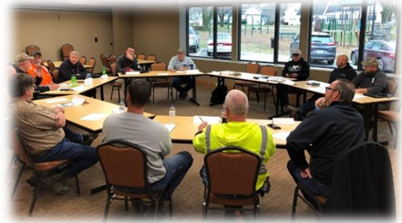
Fall 2019 Roundtable held in Dyersville.