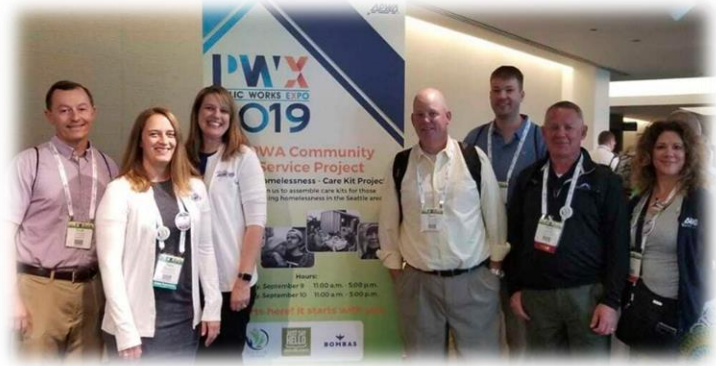
Iowa APWA Chapter Members volunteered to fill Homeless Care Kits at PWX in Seattle.

The 2019 Public Works Expo (PWX) was held in Seattle, Washington September 8-11, 2019, and many of our Iowa Chapter members took the opportunity to visit some of the area sights before and after PWX. During the conference, various Iowa Chapter members were busy not only attending the educational and general sessions, but also meeting with their National Committees, giving presentations of their own, volunteering their time at booths and service projects, serving as International