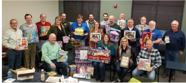
Annual Iowa Chapter Toys for Tots donation, December 6, Executive Committee Meeting

At the Iowa Chapter Executive Committee meeting on December 6, 2019, committee members were invited to bring a Toys for Tots donation. Twenty people were in attendance at that meeting and several people brought multiple toys. The Iowa Chapter's Toys for Tots donations were given to the Salvation Army Des Moines Service Center to distribute to children ages newborn through 18. Approximately 20,124 local children received gifts thanks to the generous donations received throughout the community. The Iowa Chapter was very proud to be a piece of that joy given to children during the holiday season.