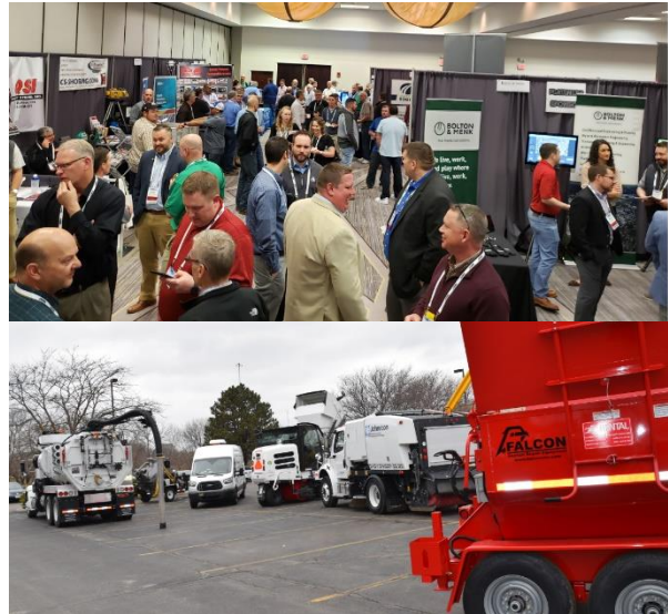
(Top) Spring Conference Vendor Booth Area (Bottom) Spring Conference Outdoor Equipment Vendors