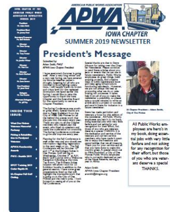
Iowa Chapter Newsletter