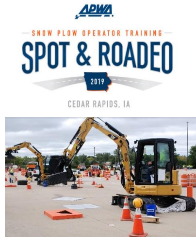
Mini Excavator Competition Action

On October 1-3, the Iowa Chapter hosted the 2019 Snow Plow Operator Training (SPOT) and Snow Roadeo in Cedar Rapids at the Kirkwood Continuing Education Training Center. There were two different events geared toward operators. The first two days were dedicated to the SPOT, which consisted of classroom and behind-the-wheel training and testing, geared towards newer snow plow operators. The event wrapped up with Iowa's Annual Snow Plow Roadeo. There were competitions and courses for a single axle truck, skid steer, and a mini excavator course. A total of 208 registered attendees participated in these events – 188 participants from 18 different agencies across the state for SPOT, 70 single axle truck teams with 2 people per team, 104 skid steer competitors, and 99 mini excavator competitors. This event was well attended and resulted in record high numbers of competitors for every event!