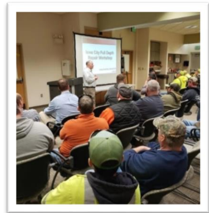
Full house for the PCC Street Repair Lunch and Learn.

On April 15, the Iowa Chapter, in conjunction with the National Concrete Pavement Technology Center and the American Concrete Paving Association, hosted a two-hour lunch and learn titled "Factors for Municipal Workers to Consider when Performing PCC Street Repairs". There were roughly 60 attendees from Iowa City, Cedar Rapids, and the surrounding communities. Spring is a great time to hold these types of events in Iowa, refreshing experienced workers and teaching new workers, just before roadway patching begins for the season.