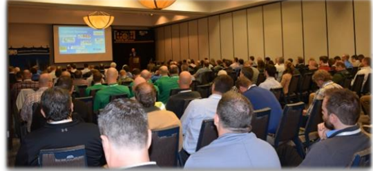
Spring Conference General Session

The third track was a leadership module on effective communication, a course from the APWA-accredited Public Employee Leadership Institute. This was developed in partnership with Iowa Local Technical Assistance Program (Iowa LTAP) who maintains the Institute. The topics included business communication, interpersonal communication, conducting effective meetings, presentation skills, interaction with the public, and use of modern technology in communication with the public. These presentations were recorded and used to update the effective communication module currently available online.