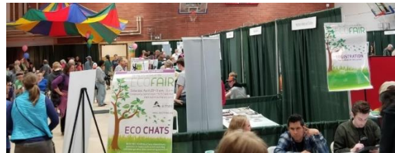
Ames Eco Fair where Public Works staff promote resiliency.

The City of Ames hosts an annual Eco Fair in their community. The Eco Fair is for Ames residents interested in learning more about water conservation, reducing electric consumption, Energy Star appliances, clean water in their rivers and streams, low impact landscaping, shrinking their carbon footprint, getting involved in environmental issues, multi-modal transportation, smart solid waste choices, and more. Participants were able to talk with City of Ames staff, interact with vendors, learn about making smart, sustainable choices, and learn about city services. The City of Ames' Public Works Department, which includes many Iowa Chapter members, is an integral part of this event and does an excellent job of promoting and showcasing the public works profession. The City also gets the community involved by participating in events at five local elementary schools where the children paint rain barrels that are given away as door prizes at the Eco Fair.