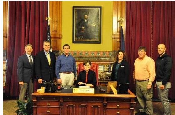
Iowa's NPWW Proclamation signing by Governor Reynolds

The APWA ISU Student Chapter has suspended club activities due to low membership participation. However, we did still have some student members within the chapter early in 2019. We plan to look into this more in 2020 to see how the Chapter can better collaborate with students at ISU. The Iowa Chapter recently discovered ISU has reduced funding for student organizations and activities this past year, which could have led to lower interest if food was unable to be provided during meetings. The Iowa Chapter will be exploring this more in 2020 to see if we can help ramp up participation. We also plan to examine options of creating University of Iowa and DMACC student chapters.