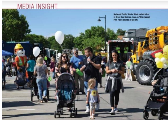
National Public Works Week event in West Des Moines, with APWA Mascot P.W. Paws featured on the left, as included in June APWA Reporter.